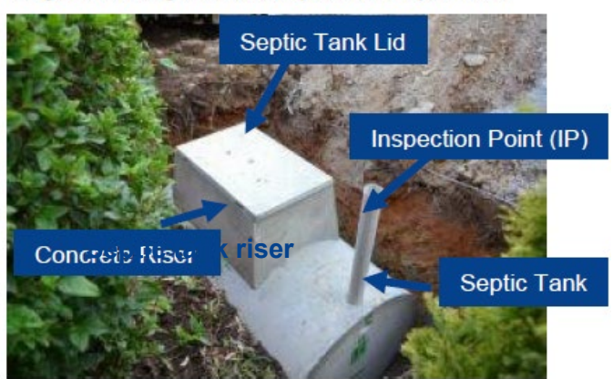
Diagram showing the different parts of a septic tank.

If you are unable to locate the lid of your septic tank, please contact Council as there may be plans available to help you.