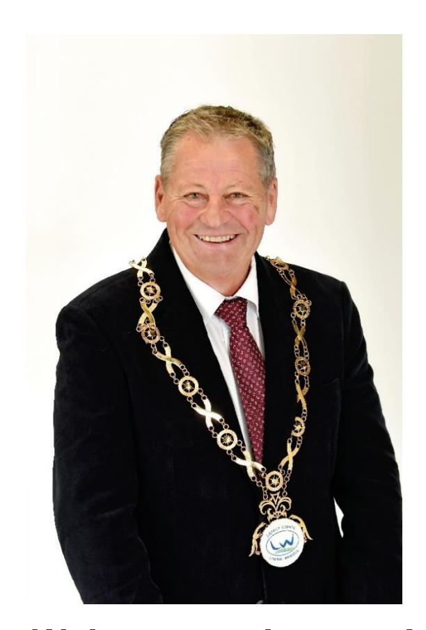
Welcome to the team!